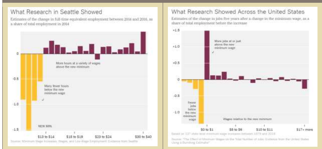
Figure 2. The University of Washington’s findings for Seattle, which does not show a “spike,” vs. a summary of findings for 137 minimum wage increases over 40 years, clearly showing a spike 50

Thus, the paradox of low-wage job losses in tandem with higher-wage job increases, and the lack of a spike, both point to the University of Washington researchers’ erroneous interpretation of the data and the unreliability of their findings.